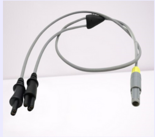
HEATER WIRE ADAPTER DUAL