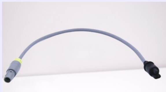
HEATER WIRE ADAPTER SINGLE