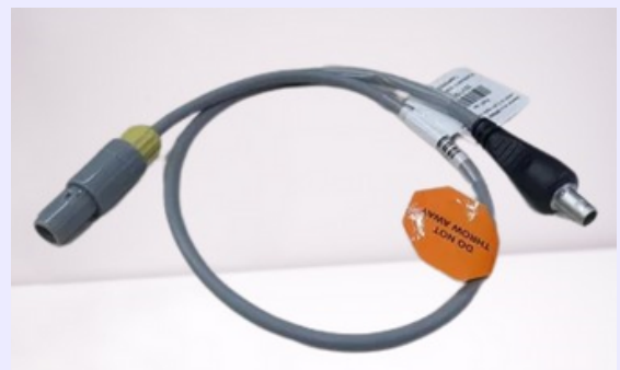
HEATER WIRE ADAPTER